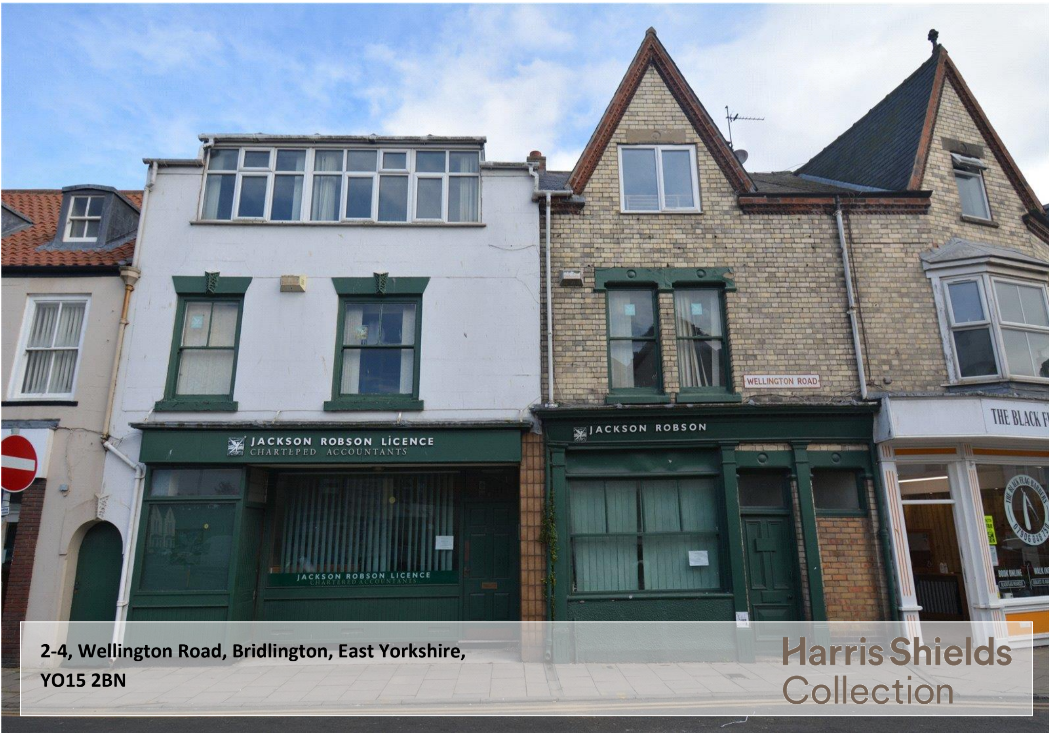
2-4, Wellington Road, Bridlington, East Yorkshire, YO15 2BN